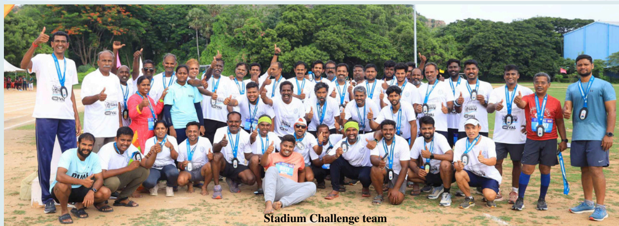
Stadium Challenge team